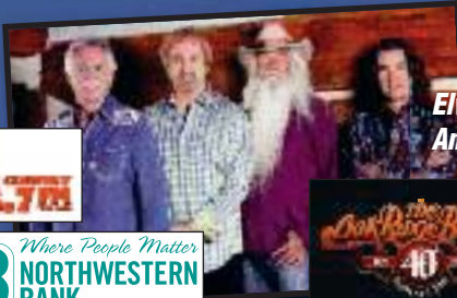
Elvira American Made